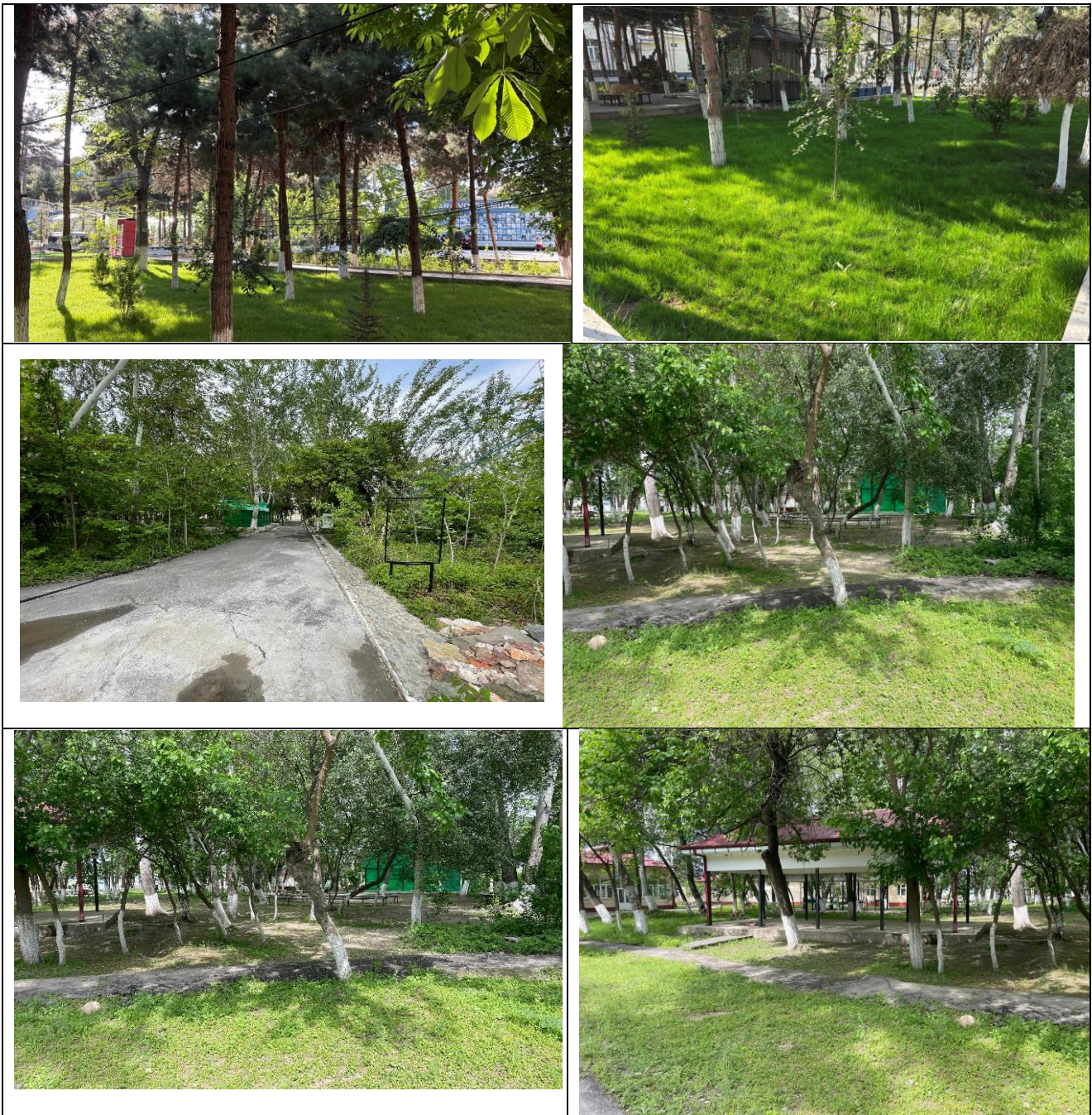
Total Planted Vegetation Area (Andijan State Institute of Foreign Languages,Uzbekistan)