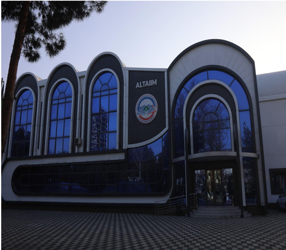
Figure 7. Sports / recreational facility photograph.