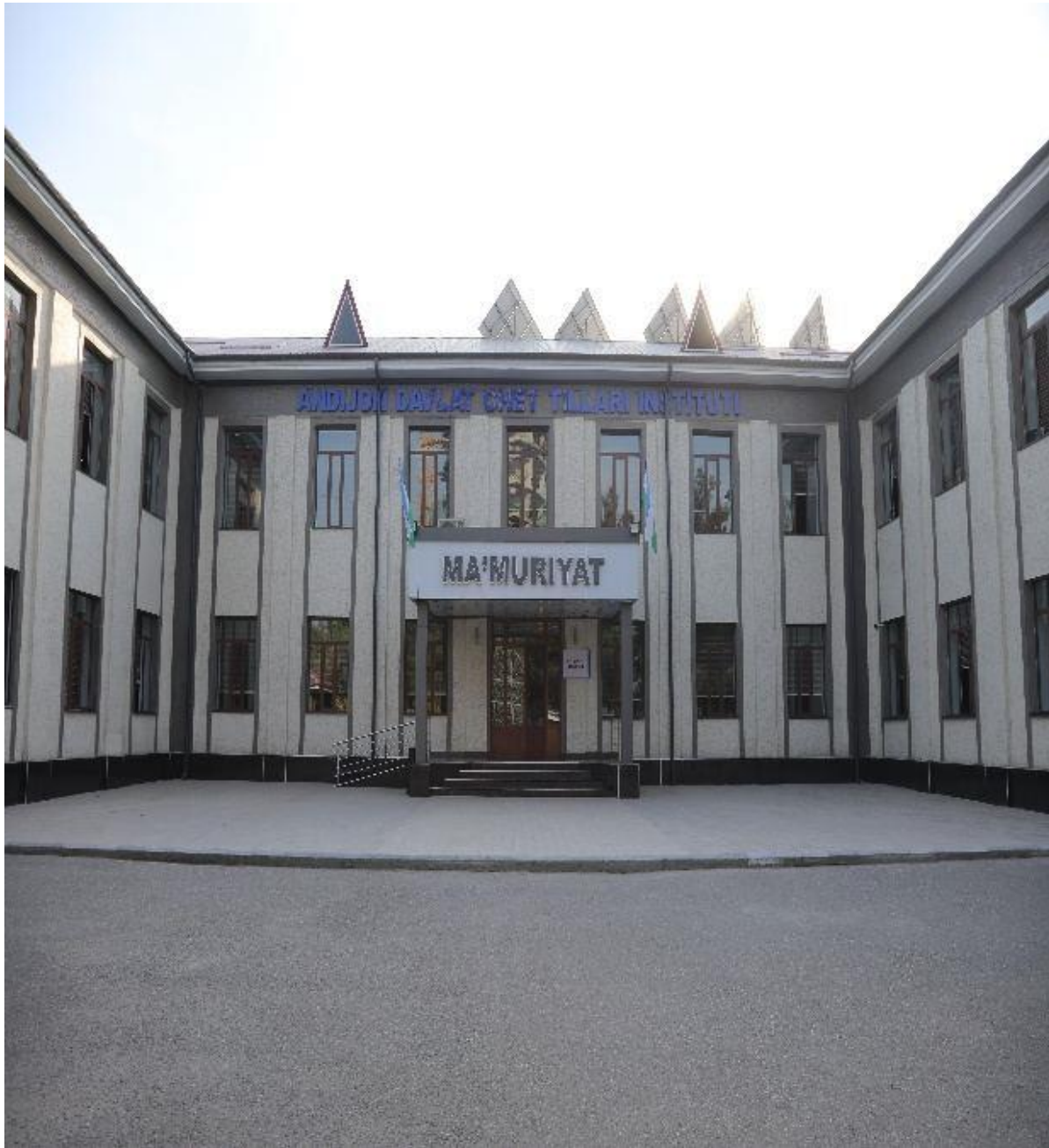
Figure 5. Academic building photograph.