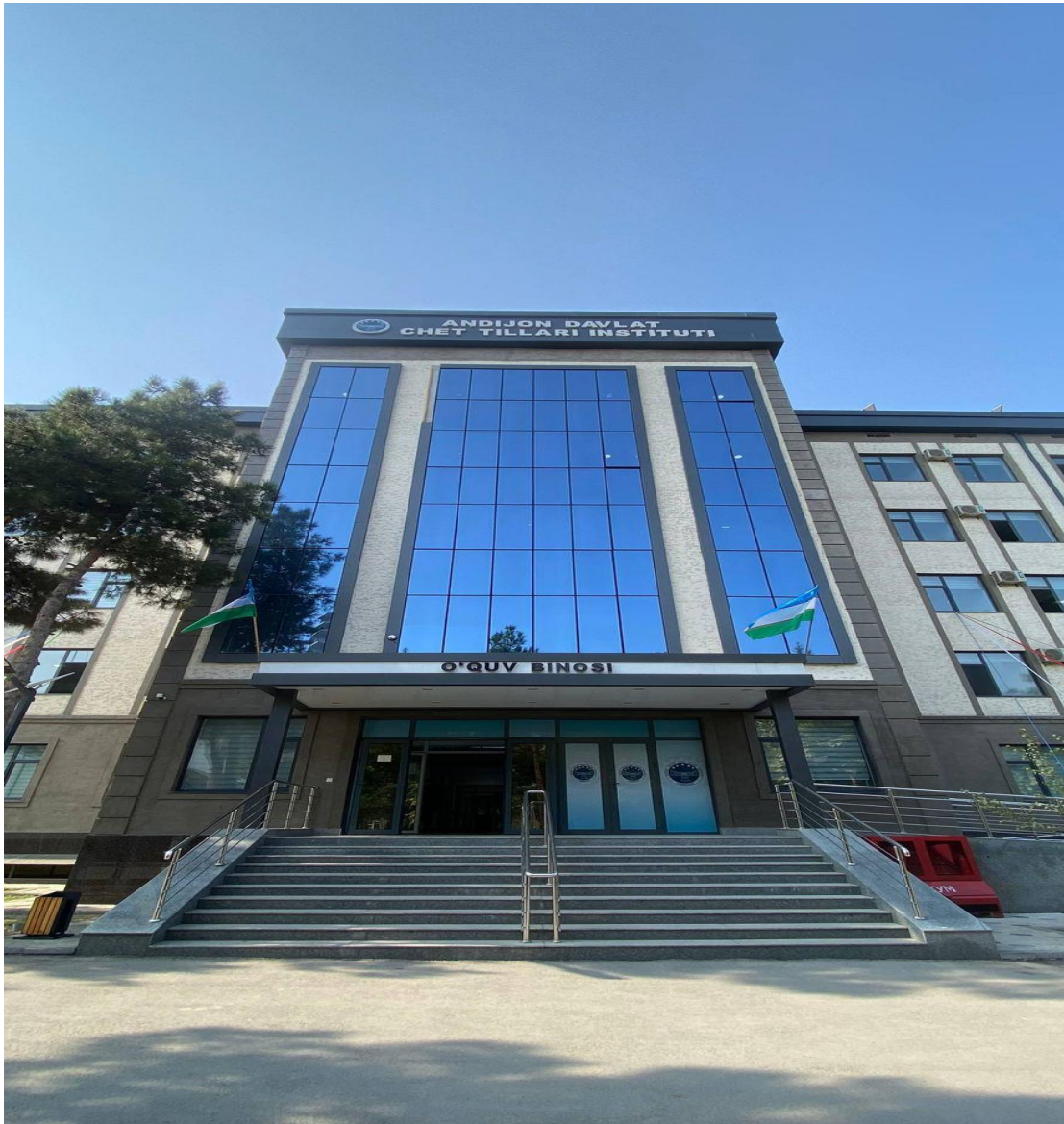
Figure 8. Multi-storey institute building photograph.