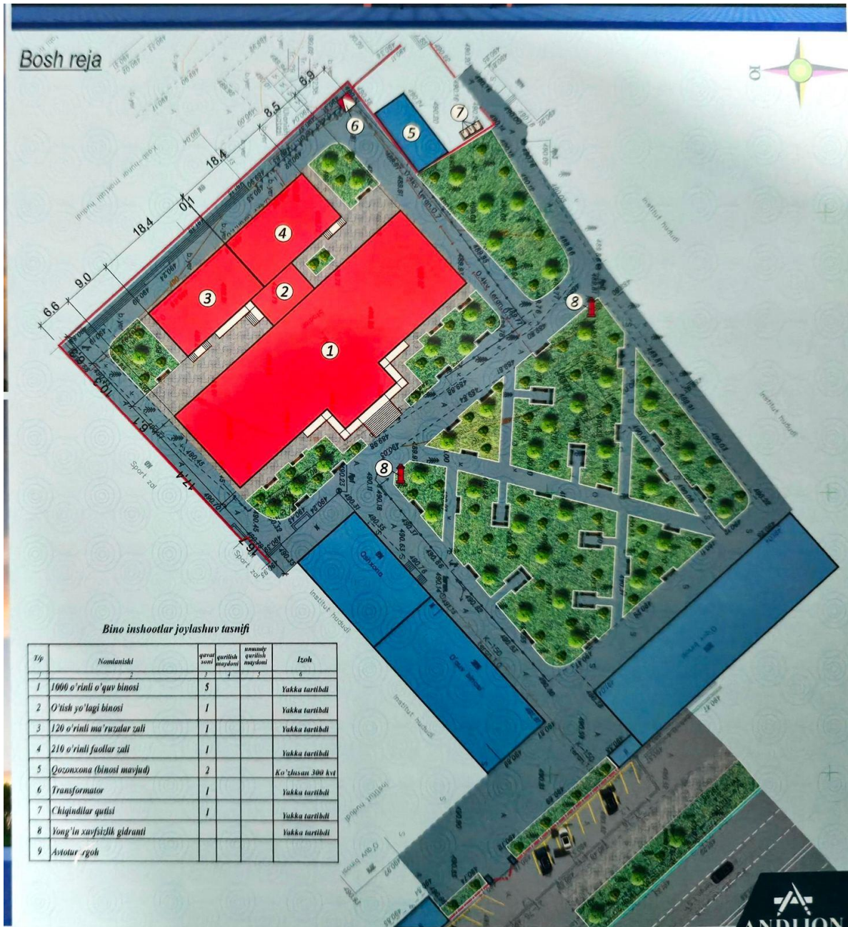
Figure 9. Affiliated land / garden layout evidence.

Based on the available evidence, the total identified campus buildings/facilities area of Andijan State Institute of Foreign Languages is 24,818.54 m 2 . Supporting land and green areas are reported separately and are not included in this total