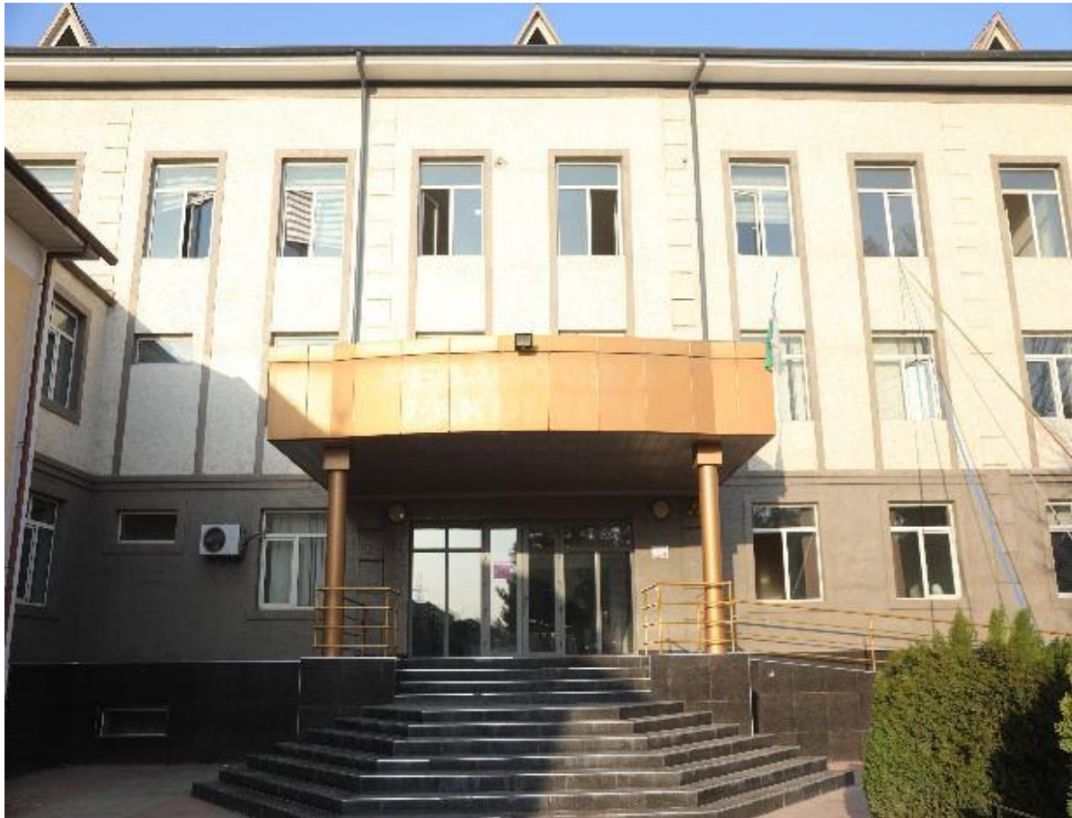
Figure 6. Academic / administrative building photograph.