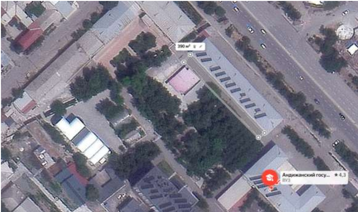
Figure 2. Google Maps measurement – Segment 2 (390 m 2 ).