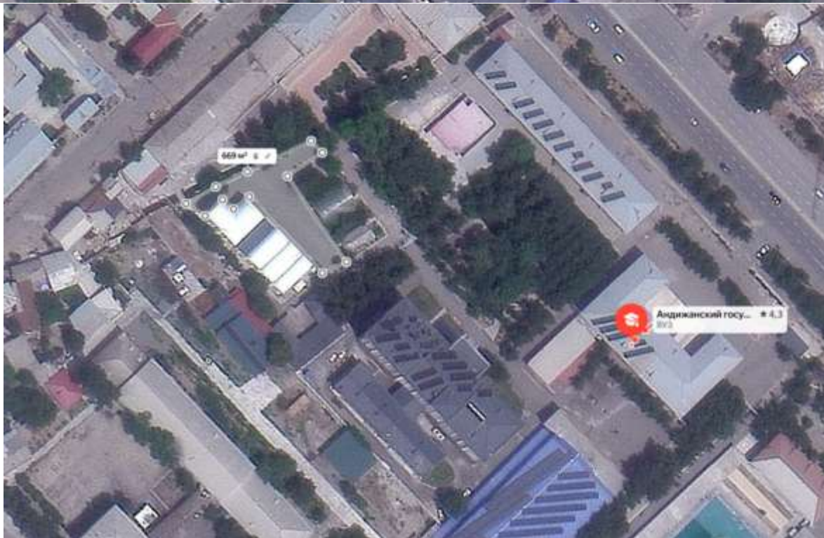
Figure 1. Google Maps measurement – Segment 1 (669 m 2 ).