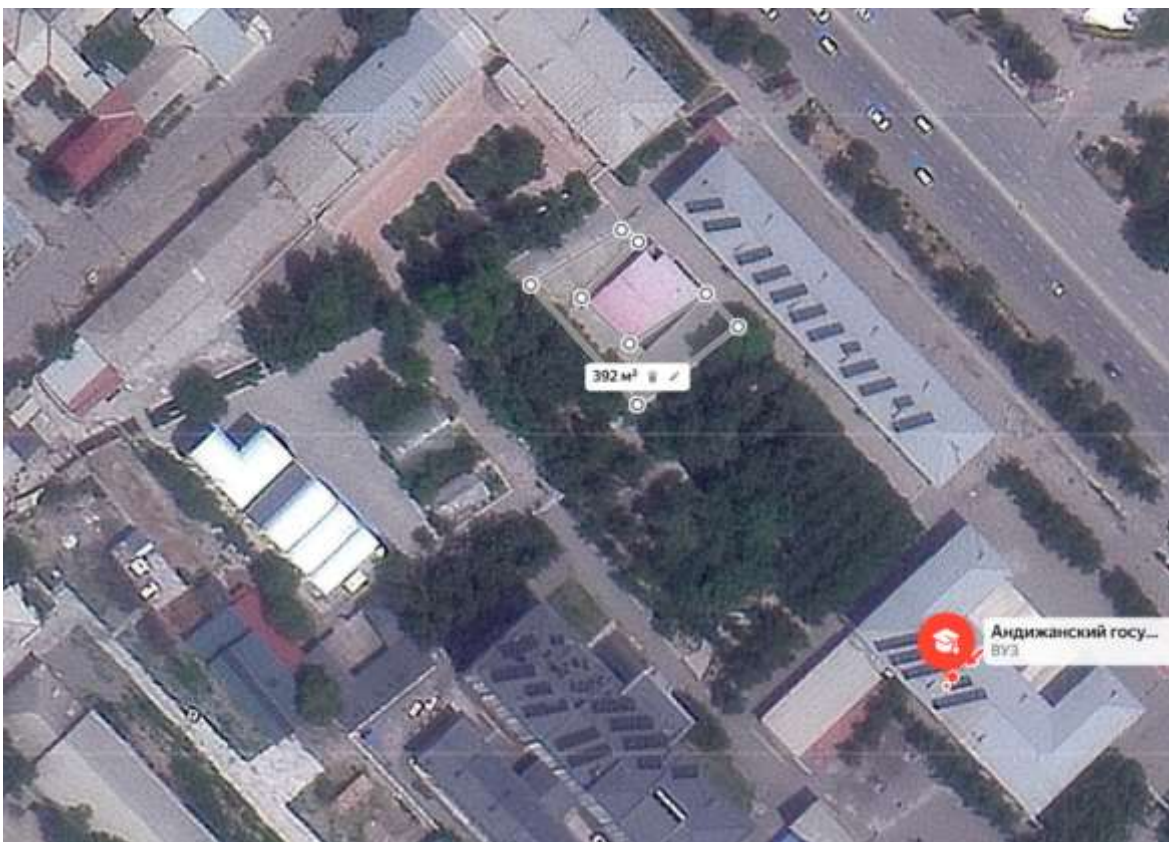
Figure 3. Google Maps measurement – Segment 3 (392 m 2 ).