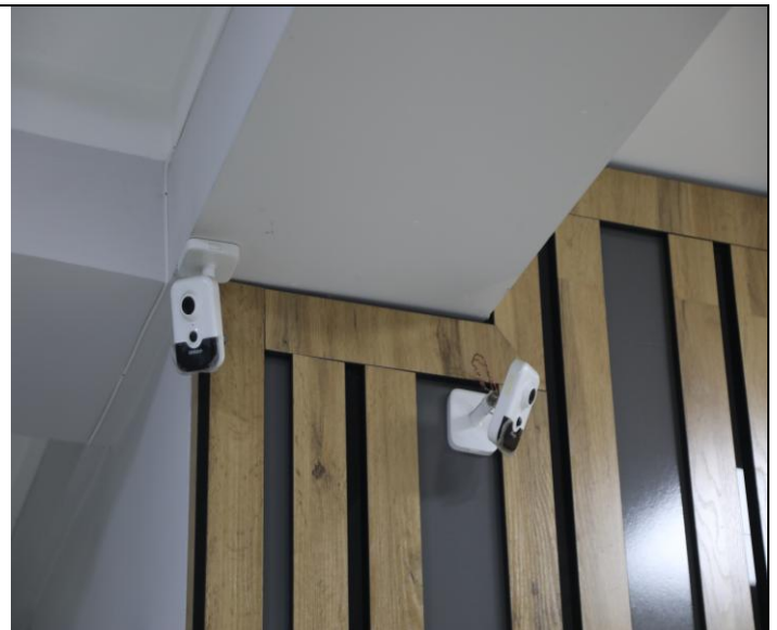
2. Cameras in educational areas