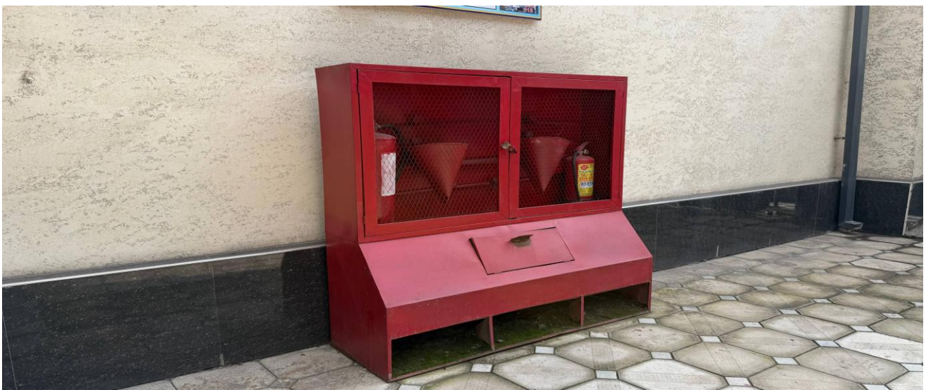
3 Fire hydrants